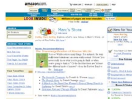
Figure 1. Insert a caption below each figure.

If you aren't familiar with Word's handling of pictures, we offer one tip: the "format picture" dialog is the key to controlling position of pictures and the flow of text around them. You access these controls by selecting your picture, then choosing "Picture..." from the "Format" menu.