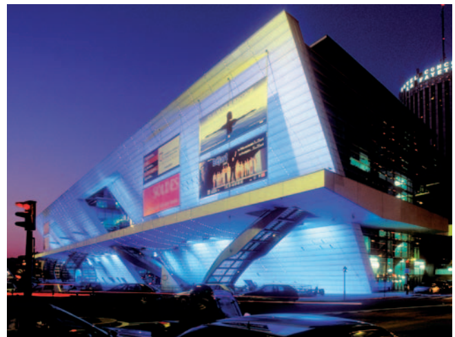
Le Palais des Congrès (site of the CHI 2013 Conference)

ACM, the world's largest educational and scientific computing society, delivers resources that advance computing as a science and a profession. ACM provides the computing field's premier Digital Library and serves its members and the computing profession with leading-edge publications, conferences, and career resources. Please visit www.acm.org for more information.